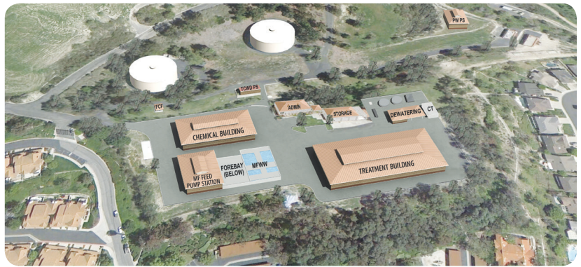
Baker Water Treatment Plant Final Site Rendering

The Baker Water Treatment Plant is a joint regional project by five South Orange County water districts, supported by community and business organizations. The completed project, located in the City of Lake Forest, provides 28.1 million gallons per day (mgd) of drinking water.