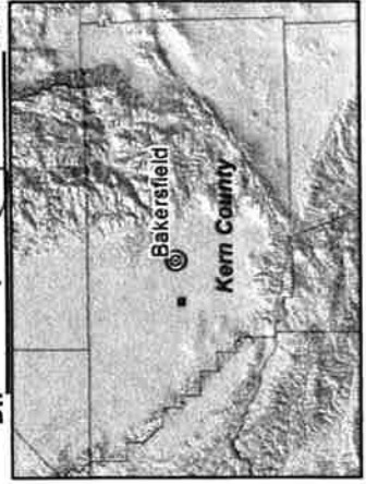
Detailed Well Location Map Strand Ranch Integrated Banking Project