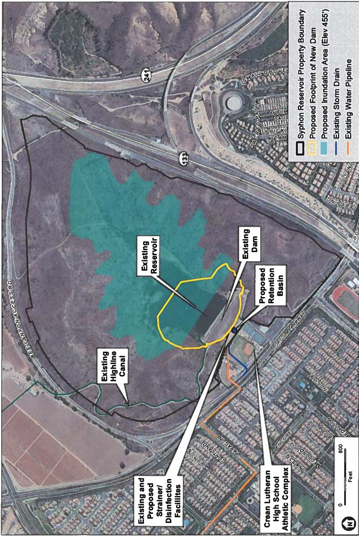
IRWD Syphon Reservoir Improvement Project Figure 2 Project Site and Proposed Project