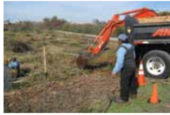
Workers clearing away bulrush and vegetation from a marsh pond.

Visitors to the Fledgling Loop Trail at the IRWD San Joaquin Marsh will need to take a detour due to construction work on the banks of several ponds.