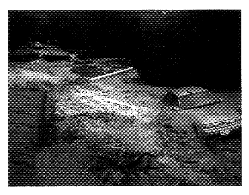
Williams Canyon (12/22/10) – Damage to Roadway and 8-inch PVC main near Creek Crossing (8-inch HDPE above-ground bypass constructed around this area)