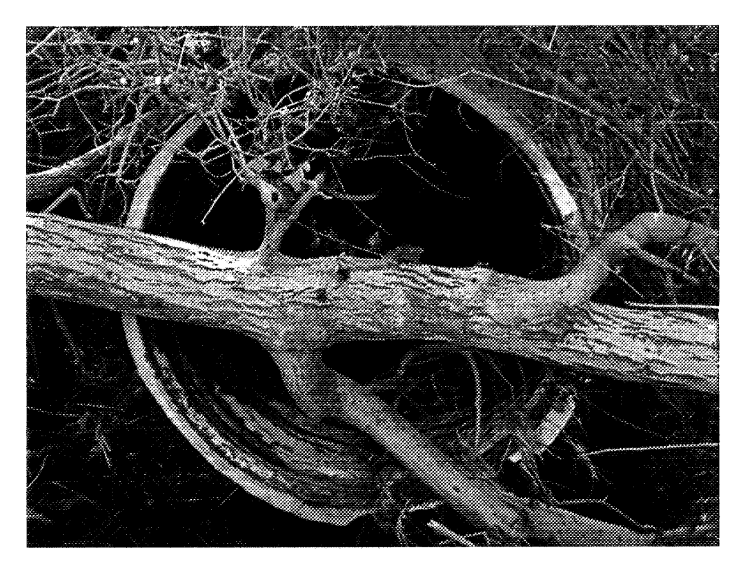
Open end of 39-inch ILP at Irvine Park