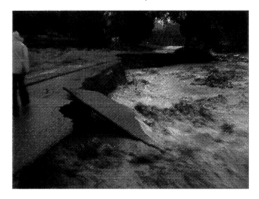
Williams Canyon – Damage to Roadway below Williams Pump Station (12/22/10)