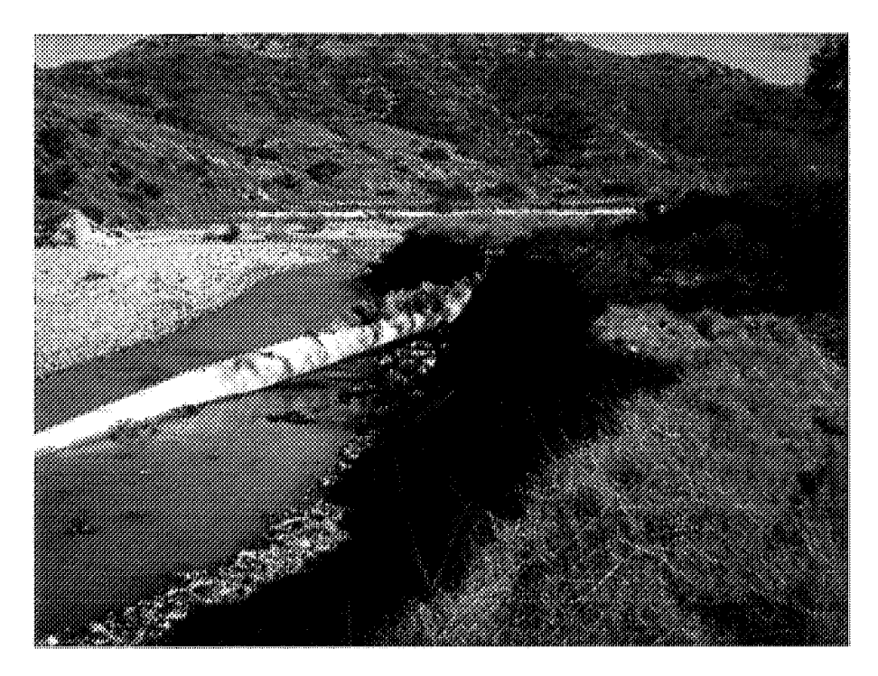
Exposed and Damaged Portion of 39-inch ILP at Irvine Park