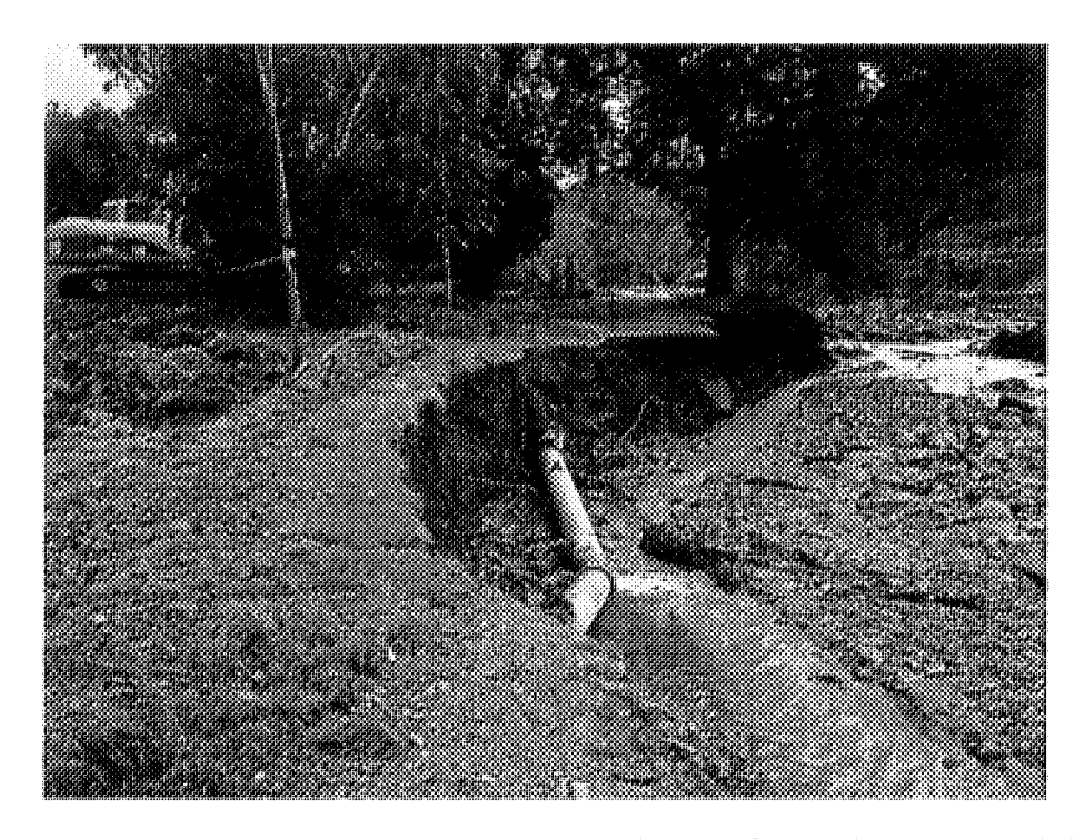
Williams Canyon – Damage to Roadway and 12-inch ACP Main below Williams Pump Station (12-inch C900 bypass constructed around this area)