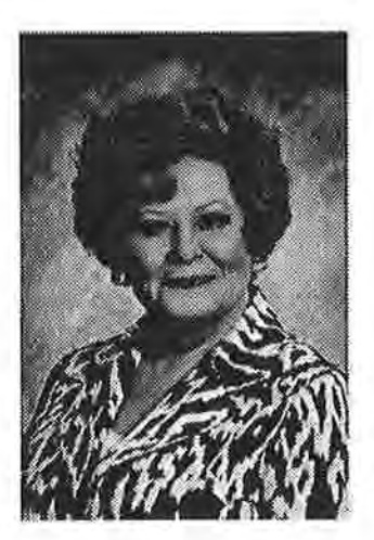
CSDA Region 6 Candidate Statement