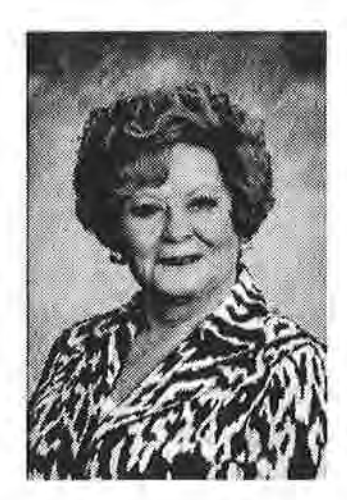
CSDA Region 6 Candidate Statement