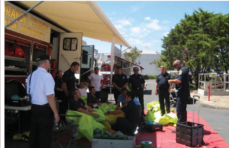
Orange County Fire Authority hazardous materials team participants prepare for the exercise held at the IRWD reclamation plant.