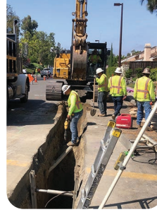
IRWD's Woodbridge Recycled Water Pipeline Project is one of many improvements currently underway.

Go to IRWD.com/construction-projects for a list of current and future large-scale projects, and click through the list for details on each project. If you don't see what you're looking for, please email info@IRWD.com or call 949-453-5500.