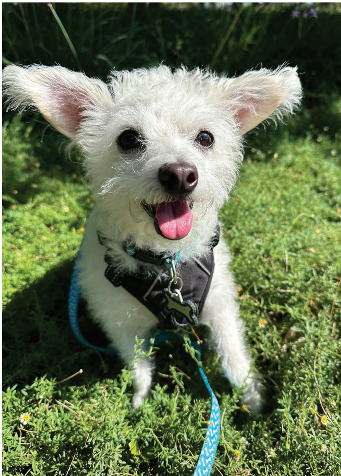
IRWD canine fan, Benny, is loving life in a patch of Kurapia.

When you weigh the balance between a happy dog and attractive lawn, the dog always wins. Backyards are ideal spaces for pets to romp, explore and do their business. But urine contains a high concentration of nitrogen that burns grass, leaving ugly yellow patches behind.