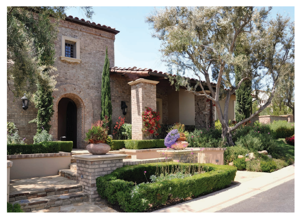
Olive trees, Italian cypress, bougainvillea and Japanese boxwood give this home a Mediterranean feel.

Tip 3: Visit IRWD.com/landscape for online tools you can use to design something beautiful that blends with the architecture of your home, character of your community, and HOA guidelines.