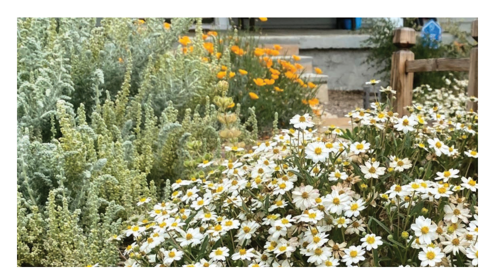
Blackfoot daisy, Montara sagebrush and California poppies enliven Ensminger's landscape.

biodiverse state in the nation. About one-third of the plants that grow here naturally don't grow anywhere else in the world. Native gardens are beautiful, save water, and provide habitat for pollinators and wildlife. The native plants in my garden attract butterflies, bees and lizards, and I love watching the birds sitting on the buckwheat. Even a small native garden can help wildlife and pollinators.