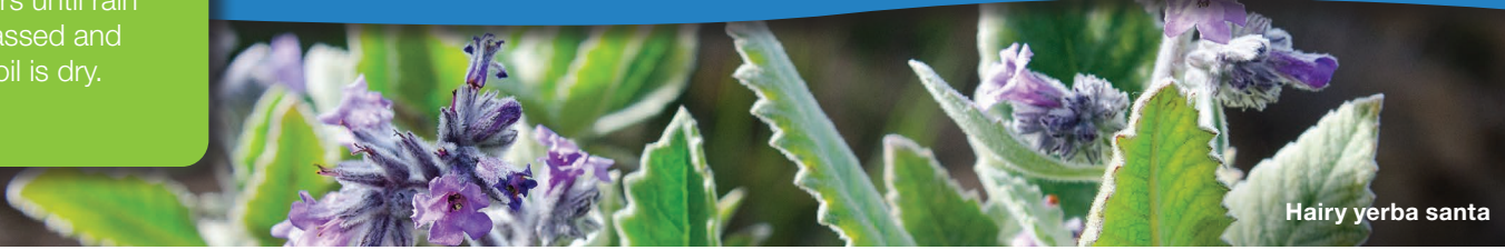
Hairy yerba santa