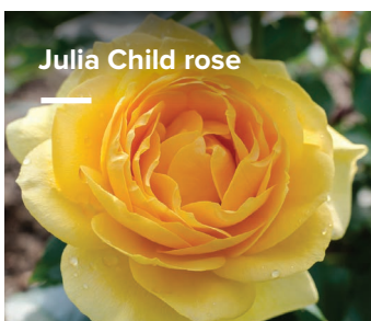
Julia Child rose