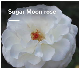
Sugar Moon rose