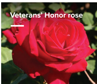
Veterans' Honor rose

Carne-Smith: January and February are typical times to cut your roses back to about waist height. We don't have a dormant season, and this tells your plants, "You have to rest for a while. Put new roots down." Remove and pick up all old mulch and every single leaf and then spray everything like crazy with dormant oil for early intervention against pests.